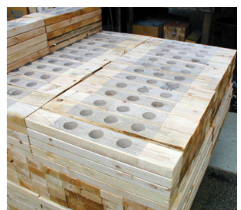
FIGURE 1. MANUFACTURED BIRD BLOCKING

Some truss manufacturers supply bird blocking with roof truss deliveries; it is a nice service to the framer and a way for the truss manufacturer to put scrap lumber to good use. That is what one manufacturer in California does on a regular basis. One day he received a call from the project structural engineer asking for the capacity of the block to transfer lateral loads as part of the roof diaphragm design. He called WTCA with this issue and once we sorted it