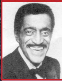
Sammy Davis, Jr. BCMC 1987 Entertainment Headliner